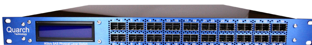
40 Port SAS Switch - Main Unit