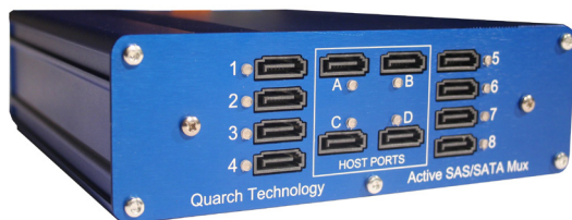
SATA Switch - Main Unit