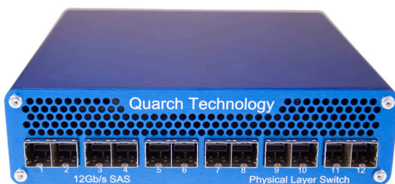
12 Port SAS Switch - Main Unit