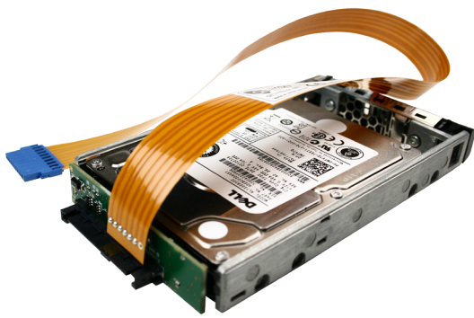
Drive Module - Attached to a drive carrier